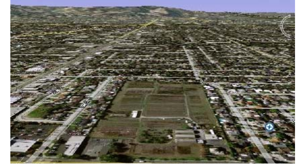
90 North Winchester Blvd, Santa Clara Across from Westfield Shopping Center (Valley Fair)

Bay Area Research and Extension Center (BAREC)